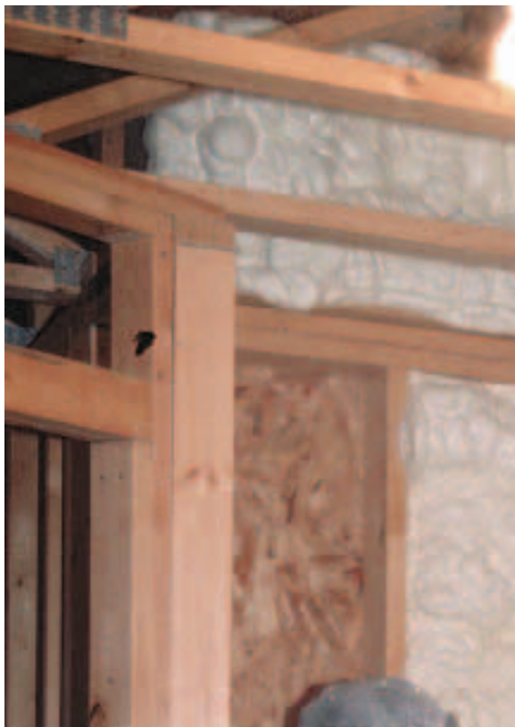
NORTH CAROLINA FOAM INDUSTRIES

A denser, 1.8-pound foam, on the other hand, has an R-value of about 7.